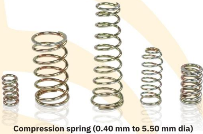
Compression spring (0.40 mm to 5.50 mm dia)

Venkateswara Steels & Springs specialises in the manufacture of precision springs and press components having manufacturing facility @ COIMBATORE & CHENNAI. The entire production facility is segregated into distinct cells, each catering to a specific product range. The company is equipped with state of the art infrastructure which ensures manufacture of various products in the shortest possible time frame.