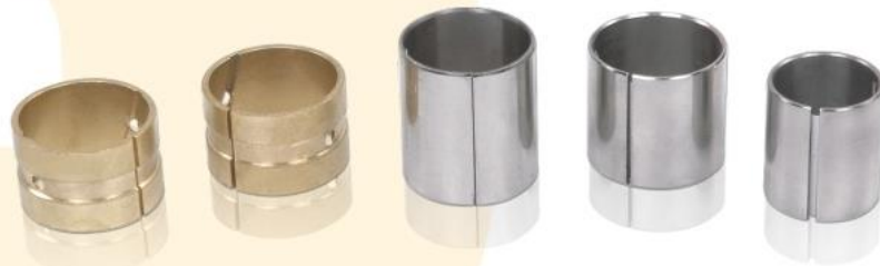
Stainless Steel and Brass Brushes

A well-equipped in-house heat treatment unit ensures that products manufactured meets performance standards at all times.