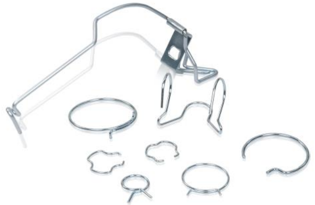
Circlips and Wire Forms