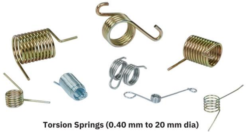
Torsion Springs (0.40 mm to 20 mm dia)

We also deliver special springs in small volumes, which find application in critical industries such as aerospace.