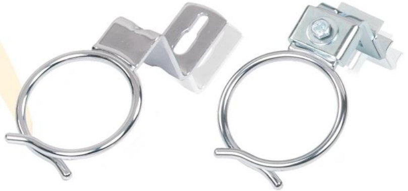
Anti Balloon Control Rings

A well-equipped in-house heat treatment unit ensures that products manufactured meets performance standards at all times.