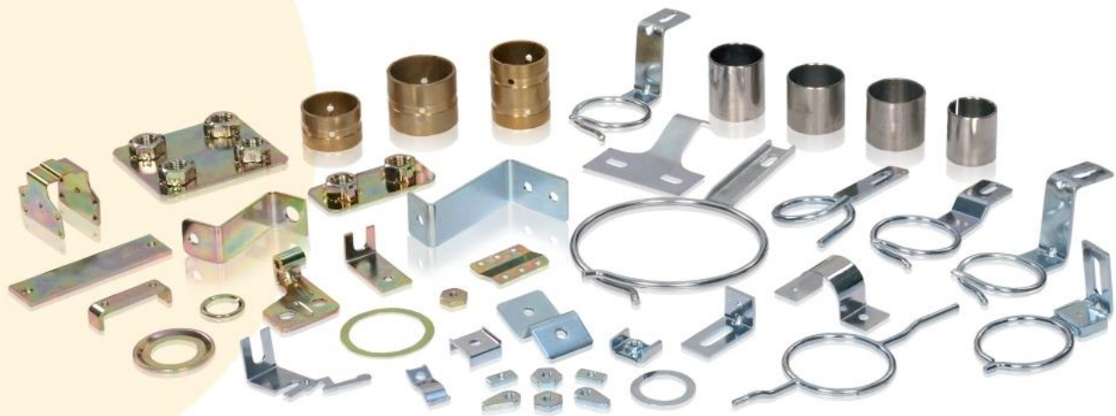
Precision Sheet Metal Components