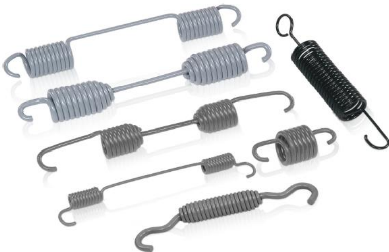
Tension spring (0.40 mm to 8 mm dia)

We understand that performance under adversity is a natural attribute for springs that come out of our production line; and we rely on the best of technology to achieve that.